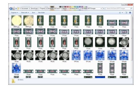
Automatic Photo Archiving for every inspection - for traceability