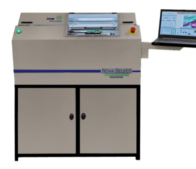
Optional Stand for NovaSelect