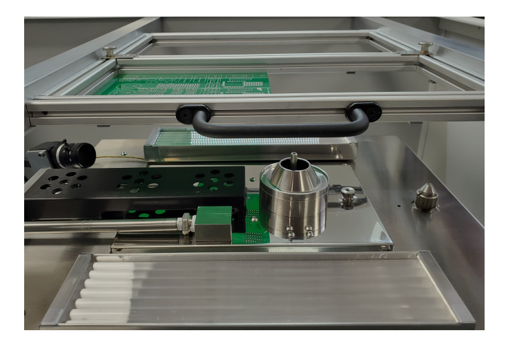
Flux, Preheat & Solder - One System