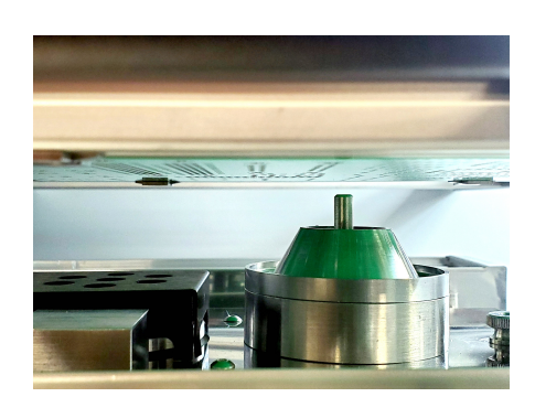
Precise, Acurate, and Reliable