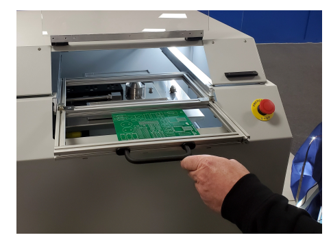
Easy Load and Unload