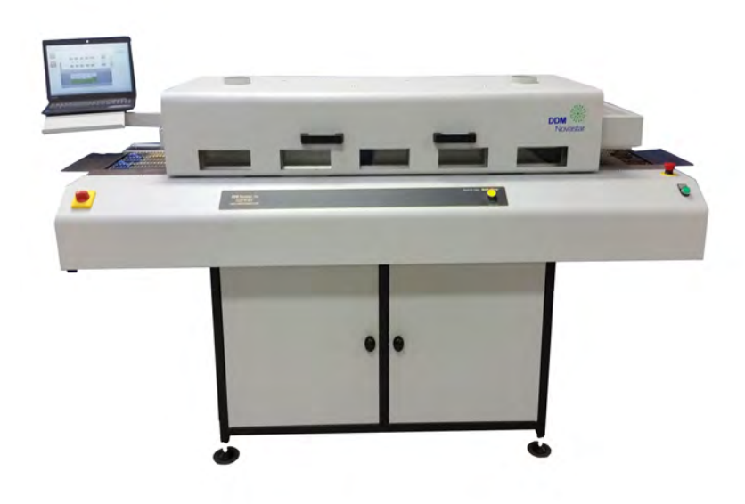
Model GF-125 HC/HT shown with optional stand.